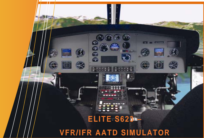
ELITE S623 VFR/IFR AATD SIMULATOR

Single/Multi-engine emergency procedures training includes: touchdown auto-rotations, anti-torque system failures and FADEC procedures when applicable.