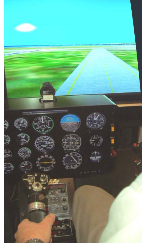
REALSIMS BELL206B JET RANGER PART TASK TRAINER

Most instructors have several thousands of flight hours on average and hold Certified Flight Instructor Instrument (CFI-II) ratings. Some have their Airline Transport Pilot (ATP) certificates and all are fully capable of transferring knowledge and experiences to their students.