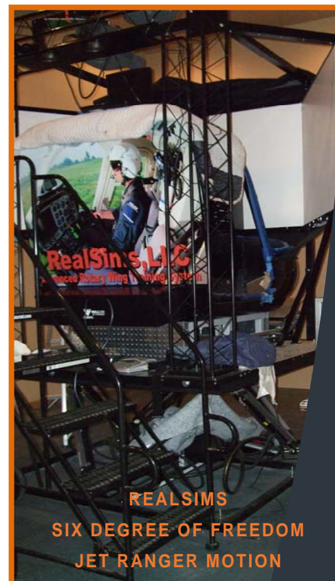
REALSIMS SIX DEGREE-OF FREEDOM JET RANGER MOTION

When registering for training, you must first meet in person or have a telephone conference with one of our flight instructors who will assess your needs and proficiency level. Visit our website and select the course(s) you wish to attend and complete the online schedule form. You will be contacted within 24 hours by an instructor who will gather additional information and answer questions regarding the training you require.